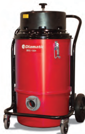
Diamatic BDC-1324 Dust Collector

Diamatic/DMS 5220 Gaines Street San Diego, CA 92110