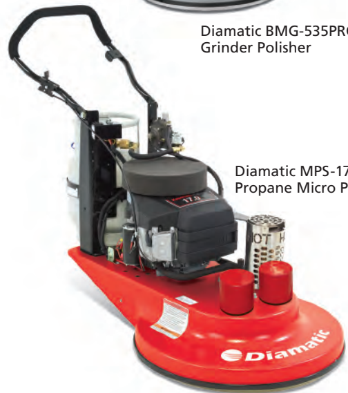
Diamatic MPS-1727 Propane Micro Polisher