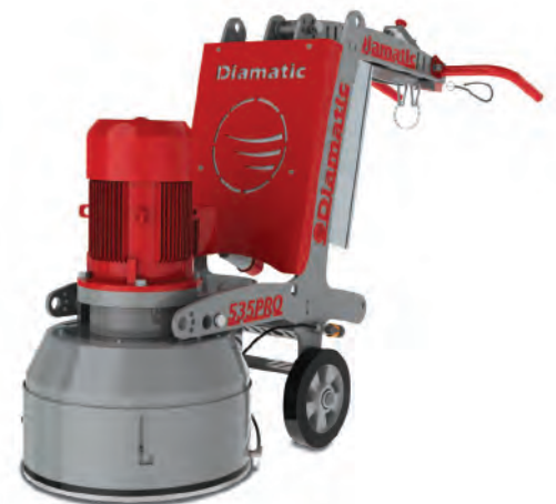
Diamatic BMG-535PRO Grinder Polisher

Diamatic Management Services is a division of Blastrac/Diamatic NA that provides professional training and specification for polished concrete floors. Utilizing the best in training and manufacturing from Blastrac and Diamatic, DMS certifies contractors to be the best in professional concrete polishing. DMS is committed to excellence and will be an integral part of every floor system to ensure consistent quality and repeatability of finished results.