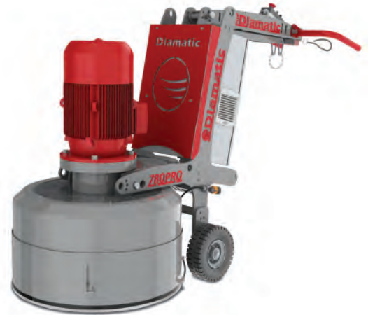
Diamatic BMG-780PRO Grinder Polisher